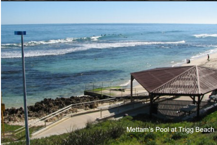
Mettam's Pool at Trigg Beach