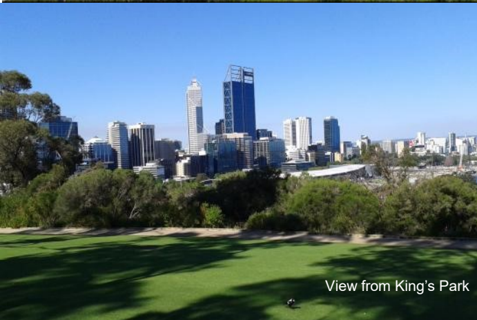
View from King's Park