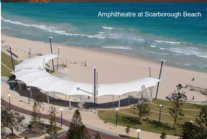
Amphitheatre at Scarborough Beach

If you miss it during the day, you can always visit at night.