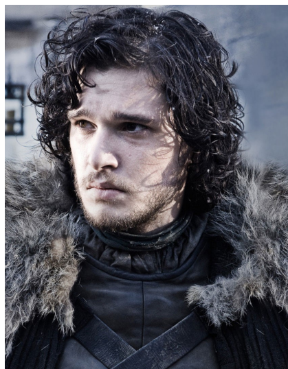
Actor: Kit Harrington Full name: Christopher Catesby Harrington

A truly fascinating transcript of what happened that day.